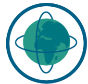
Proven global technology